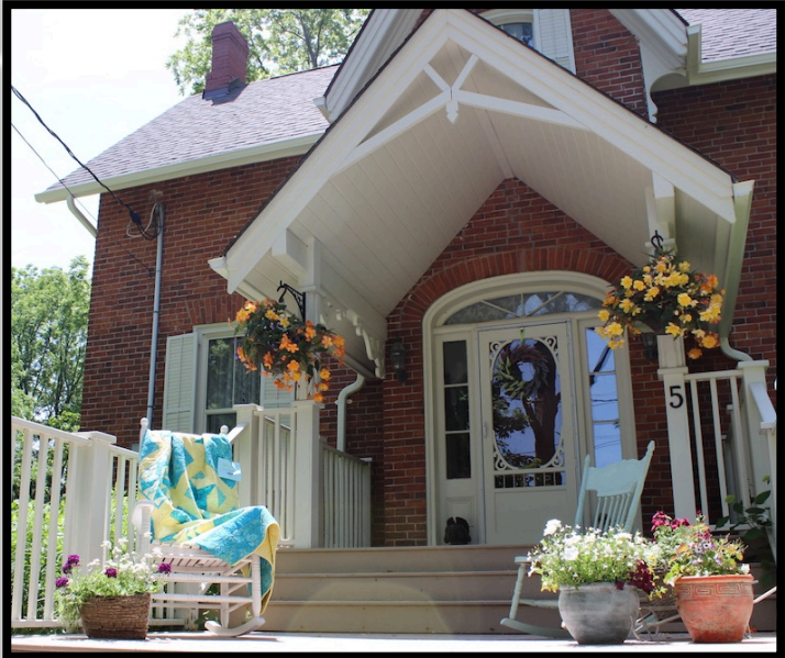
Blocks & Blooms, June 15, 2025