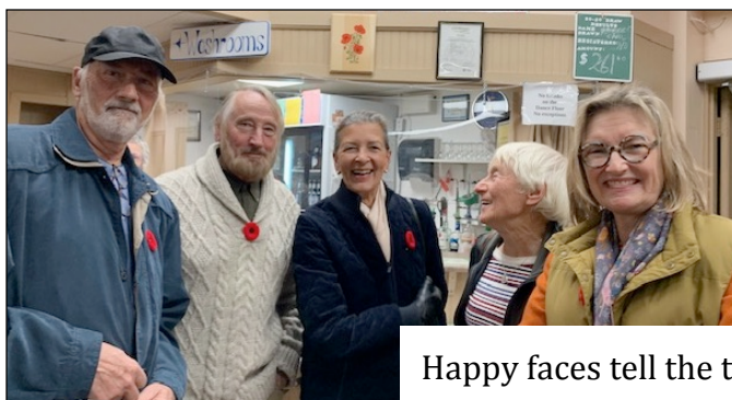
Happy faces tell the tale!