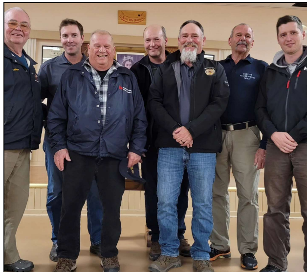
Honouring the service of our volunteer firefighters at our October 2023 gathering at the Royal Canadian Br. 402 Legion Hall.