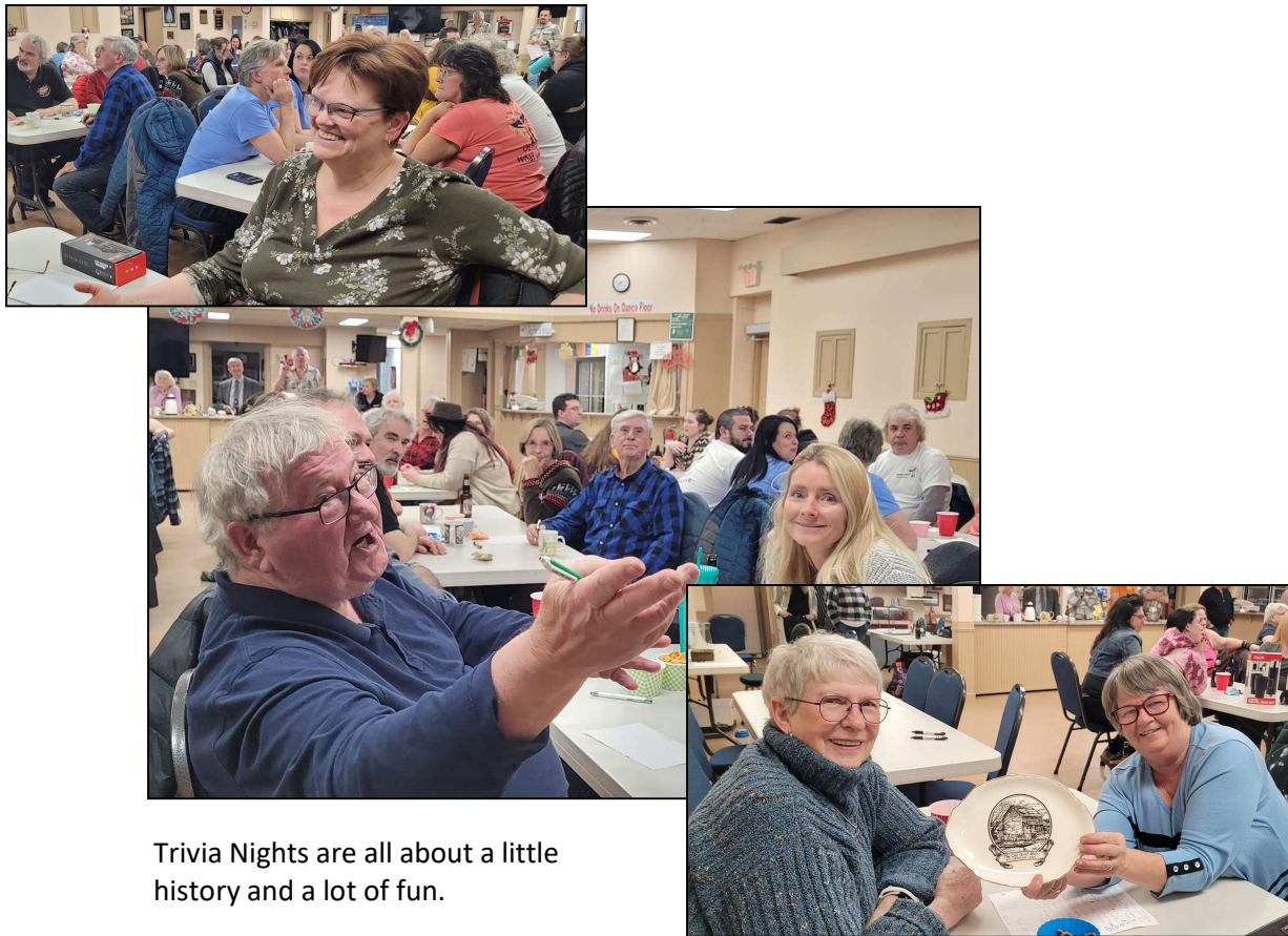
Trivia Nights are all about a little history and a lot of fun.

The Annual Meeting adjourned at 7:50 pm.