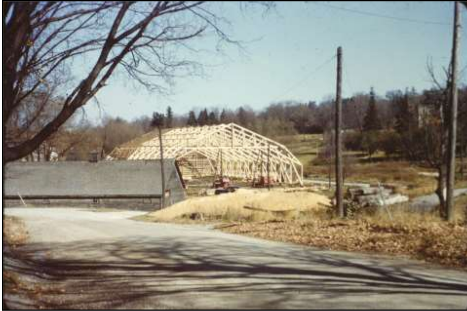
1950 Construction of the first indoor ice arena built next to Needler's Mill and the Millbrook Dam in downtown Millbrook.